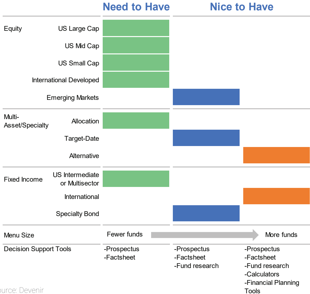
Figure 2: HSA Menu Asset Class Prioritization